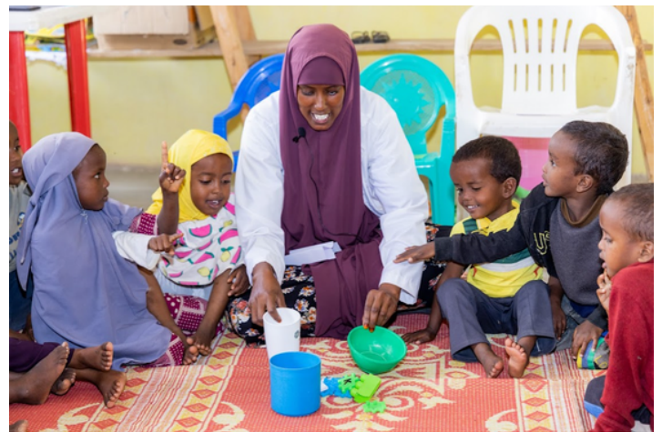
Children learning through play in Ethiopia